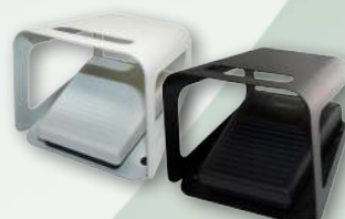
With 6202 Guard