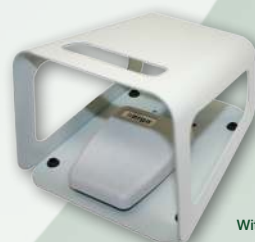
With 6202 Guard