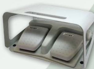
With 6202 Guard