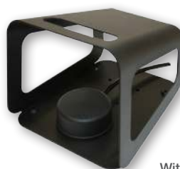
With 6202 Guard