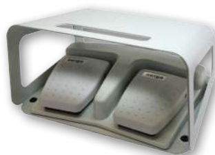
With 6202 Guard