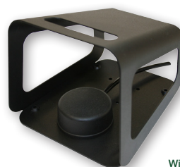
With 6202 Guard